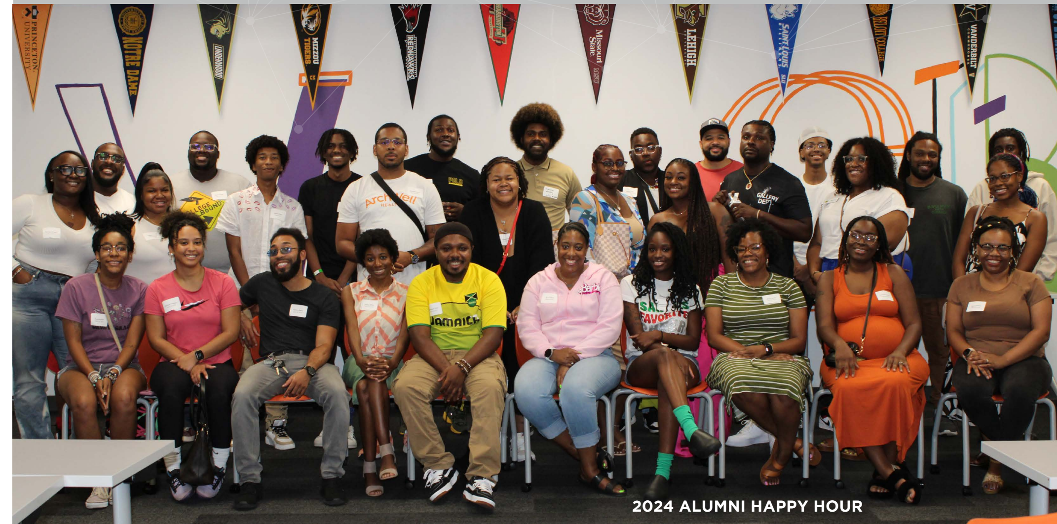
2024 ALUMNI HAPPY HOUR

“EDUCATION IS THE MOST POWERFUL WEAPON WHICH YOU CAN USE TO CHANGE THE WORLD.” - NELSON MANDELA