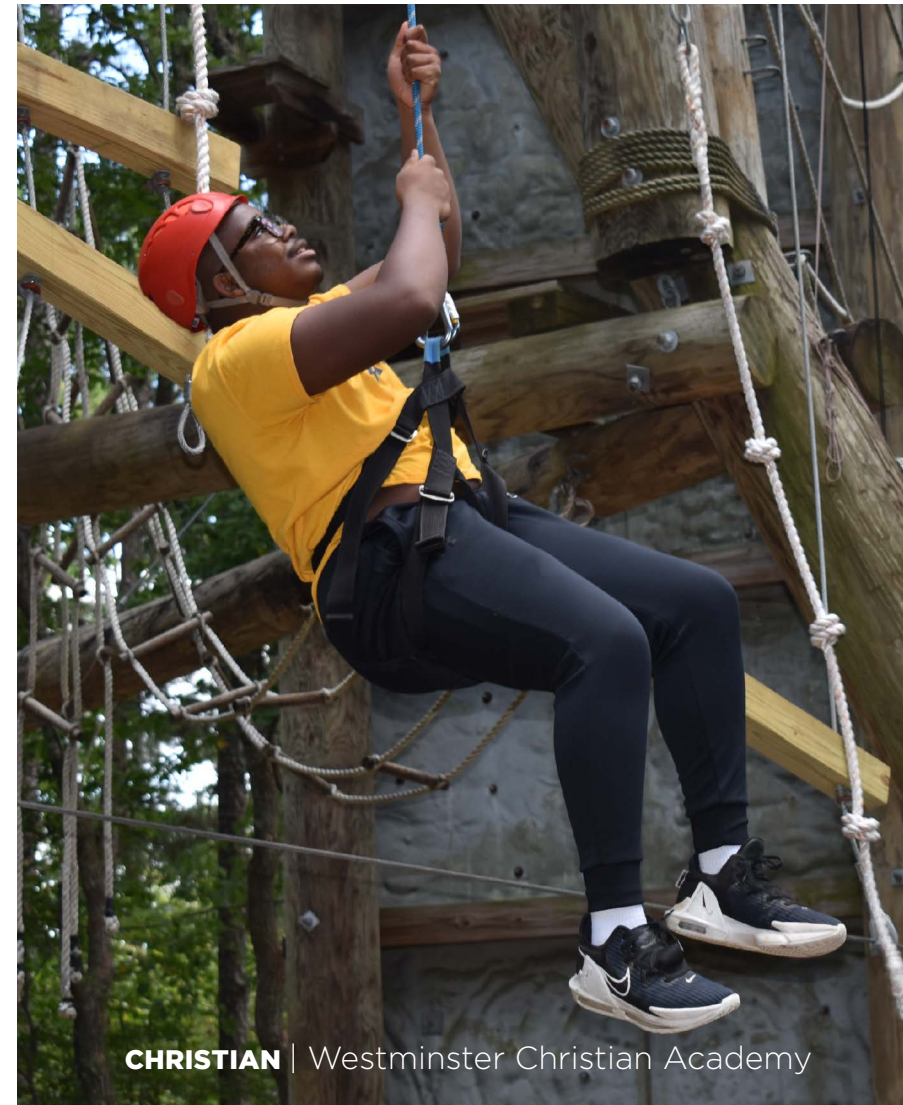
CHRISTIAN | Westminster Christian Academy

The star of the show during the fall is sophomore camp! In October of 2023, students spent a weekend at Sherwood Forest Camp in Lesterville, MO. Designed to help students bond with each other and their CB coaches, students challenged themselves on the ropes course, learned the basics of kayaking and canoeing, and flew through the trees on the zip line. For many students, overnight camp was a new experience and the joy felt by students and staff alike was palpable.