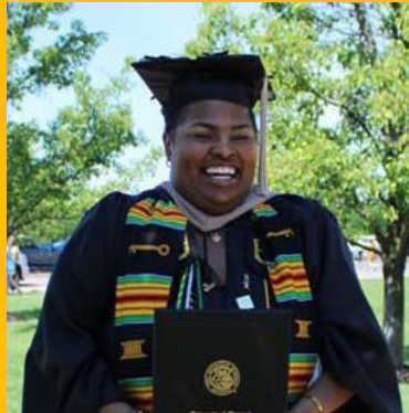
University of Missouri-Columbia