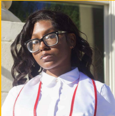
Southeast Missouri State University