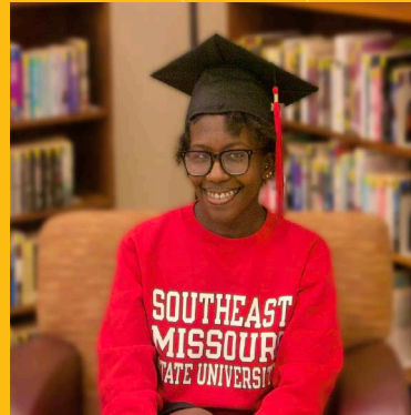
Southeast Missouri State University