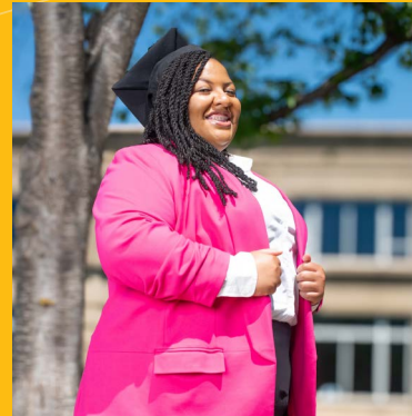
Southeast Missouri State University