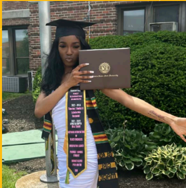
Harris-Stowe State University