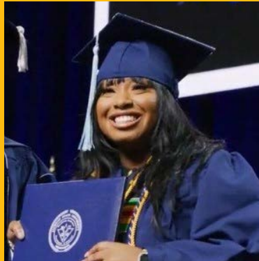
Jackson State University