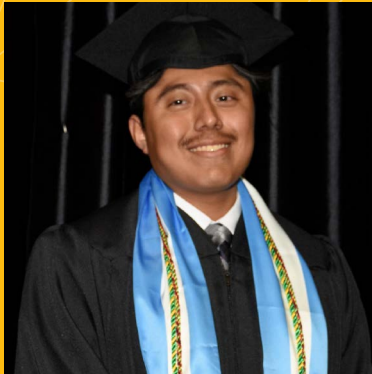
University of Missouri-St. Louis